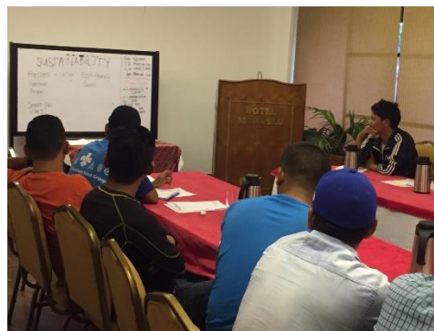
Photos: Guide working trainings and Himalayan Trails office staff sustainability training

Health and safety was another area impacted by the events of 2020-2022, an area which was not on our radar as needing any modifications, but the public health crisis of the covid 19 pandemic did warrant some changes. As a result, we avoided any outbreaks and kept our guests and staff safe and healthy.